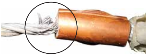
Cable fraying at swage contact point

(Swage may be located beneath rubber stopper)